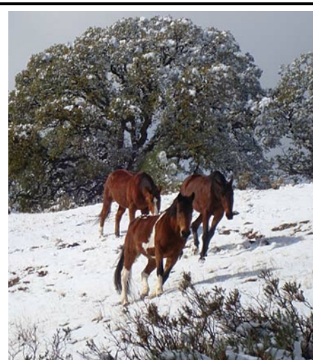
Jill's happy horses - living naturally!

I've strayed a long way from the subject of barefoot hoof care, but good horsemanship is like dominoes: one thing leads to another. In committing to responsible care of the hoof, we are led to consider many other aspects of our horsekeeping practices as well. For me it has been, and continues to be, a fascinating and utterly gratifying journey.