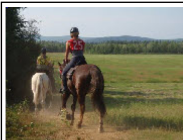
Riders make their way beside the hay fields on their way to the river.

The whole group of people attending the awards dinner claps long and loud for the first time competitor, a young girl from a remote area, who wins her first ribbon in that huge CP